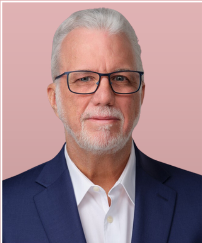
DR PHILIPPE COUILLARD, MD

31 ST PREMIER OF QUEBEC | 31 ÈME PREMIÈRE DE QUÉBEC 2014-2018