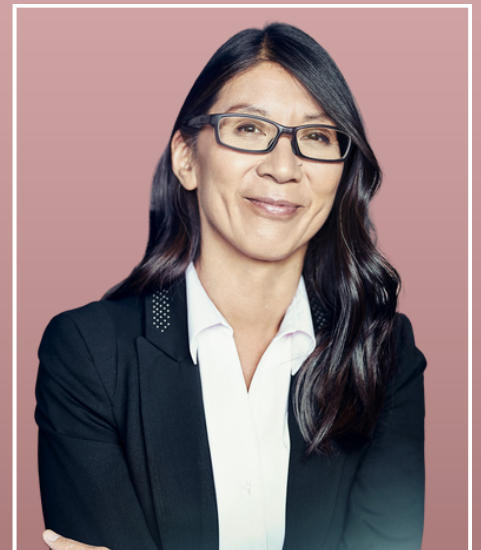
DR. JOANNE LIU, MD

Dr Joanne Liu, qui détient une carrière remarquable dans l'humanitaire, est un médecin pédiatre d'urgence pratiquant au Canada. Dr Liu enseigne à l'École de santé publique et mondiale de l'Université McGill, où elle se concentre sur les pandémies et les urgences sanitaires au sein du laboratoire de préparation aux pandémies et aux urgences sanitaires (PERL). Avant de rejoindre McGill, Dr Liu a commencé sa carrière avec Médecins Sans Frontières/Doctors Without Borders (MSF) en 1996 et a été présidente internationale de MSF pendant plus de six ans, de 2013 à 2019. Grâce à son leadership, elle a dirigé les réponses aux urgences humanitaires et sanitaires, y compris les épidémies en Afrique de l'Ouest (Ebola 2014-2016) et centrale, au Moyen-Orient, en Asie centrale, en Asie du Sud-Est, dans les Caraïbes et en Amérique centrale.